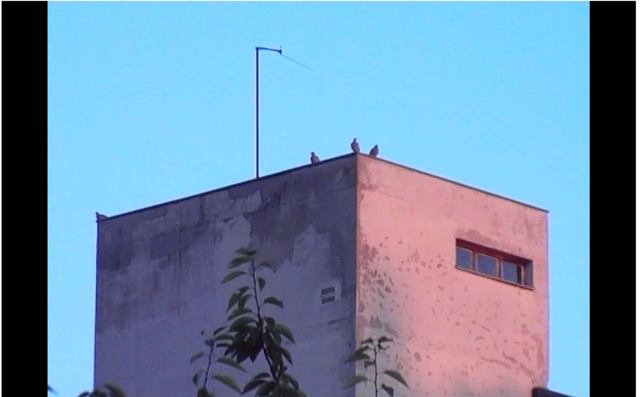
part 48, 2024 videostill