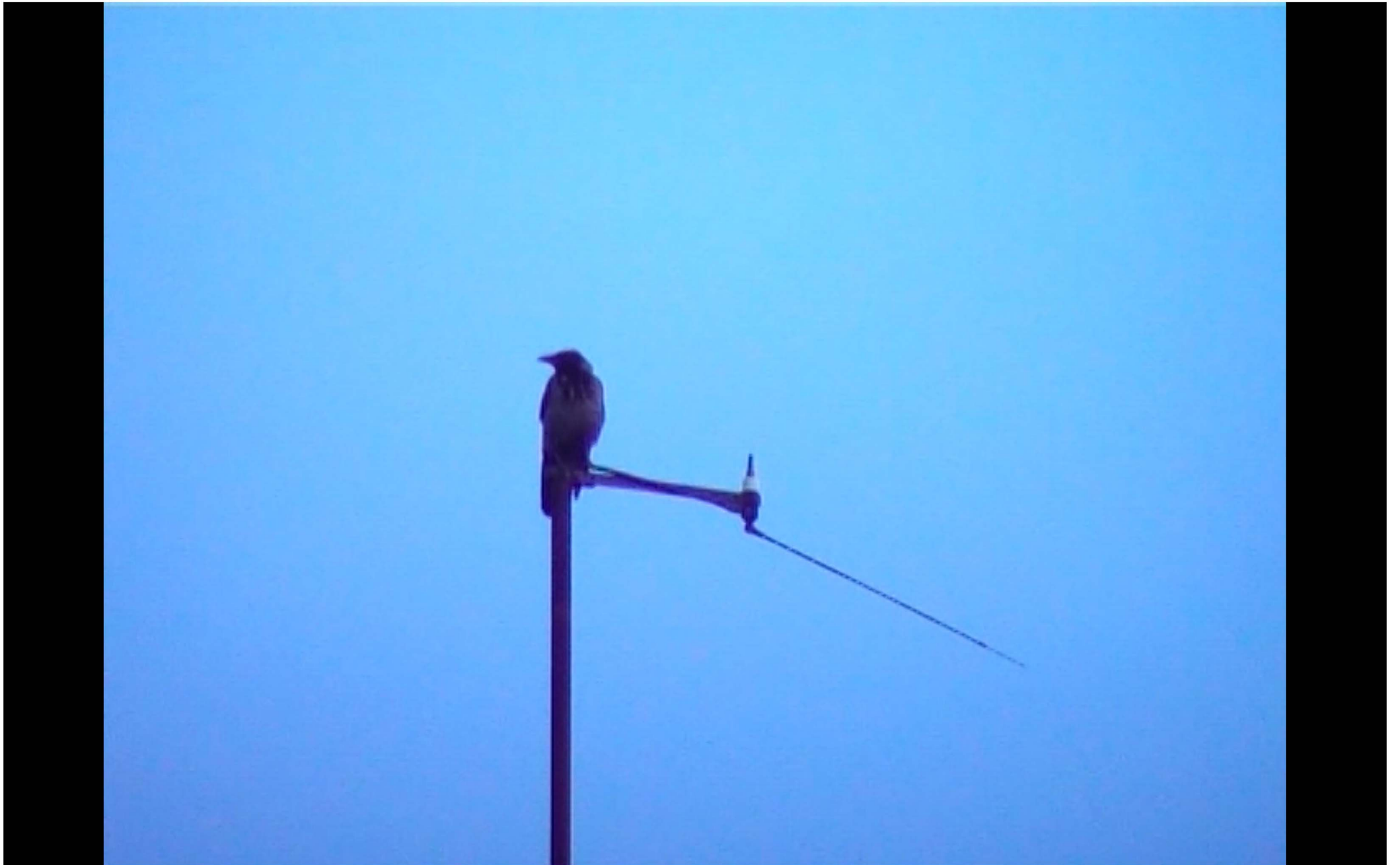
part 48, 2024 videostill