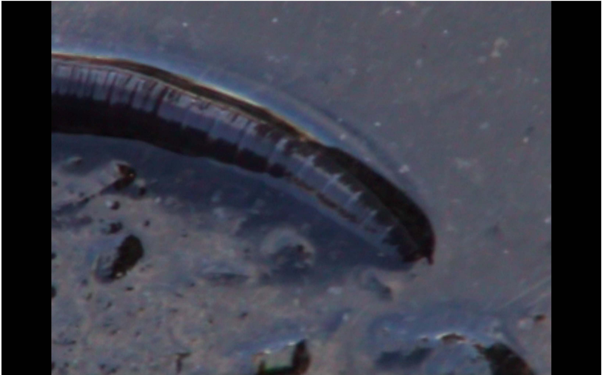
part 48, 2024 videostill