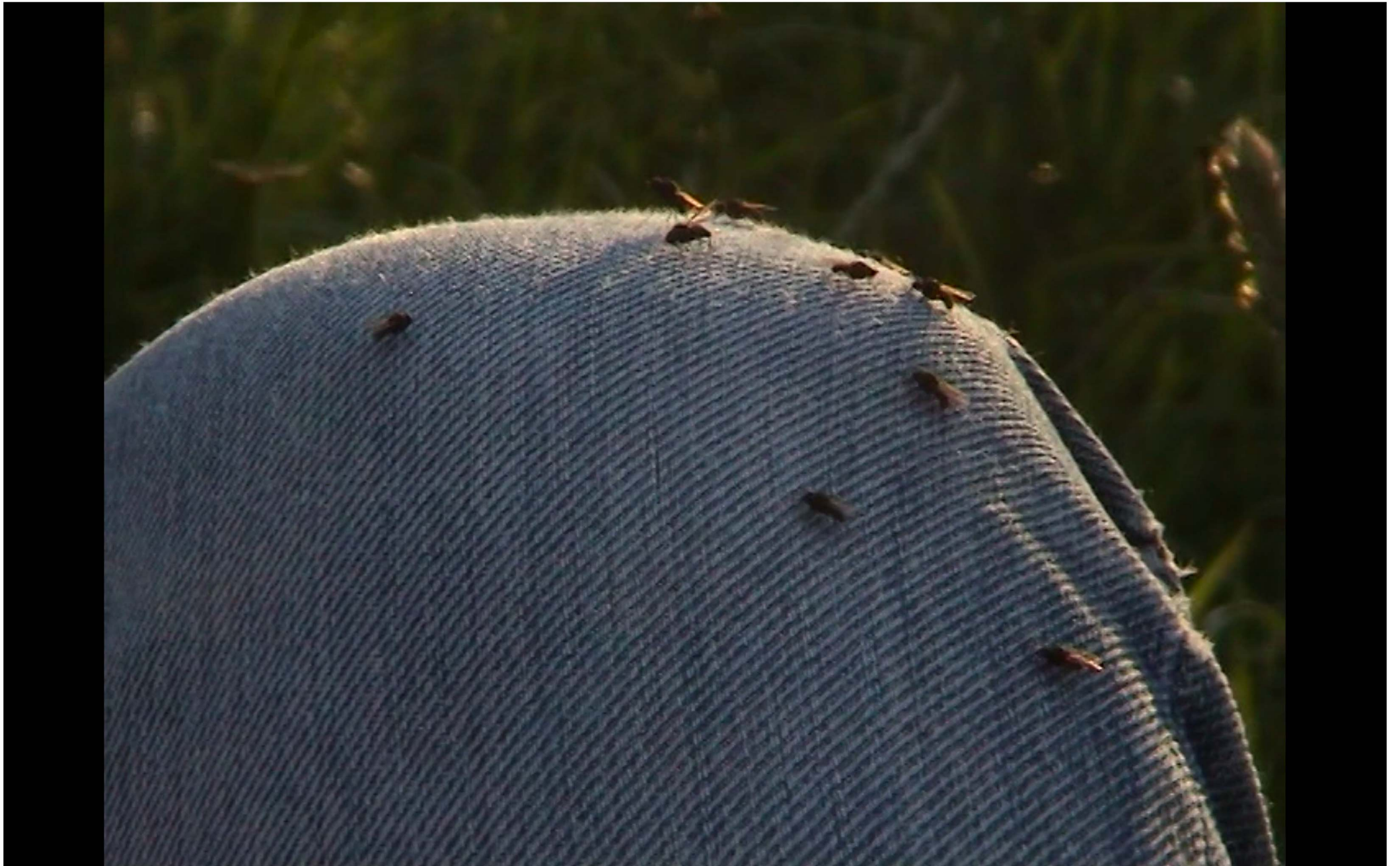
part 48, 2024 videostill