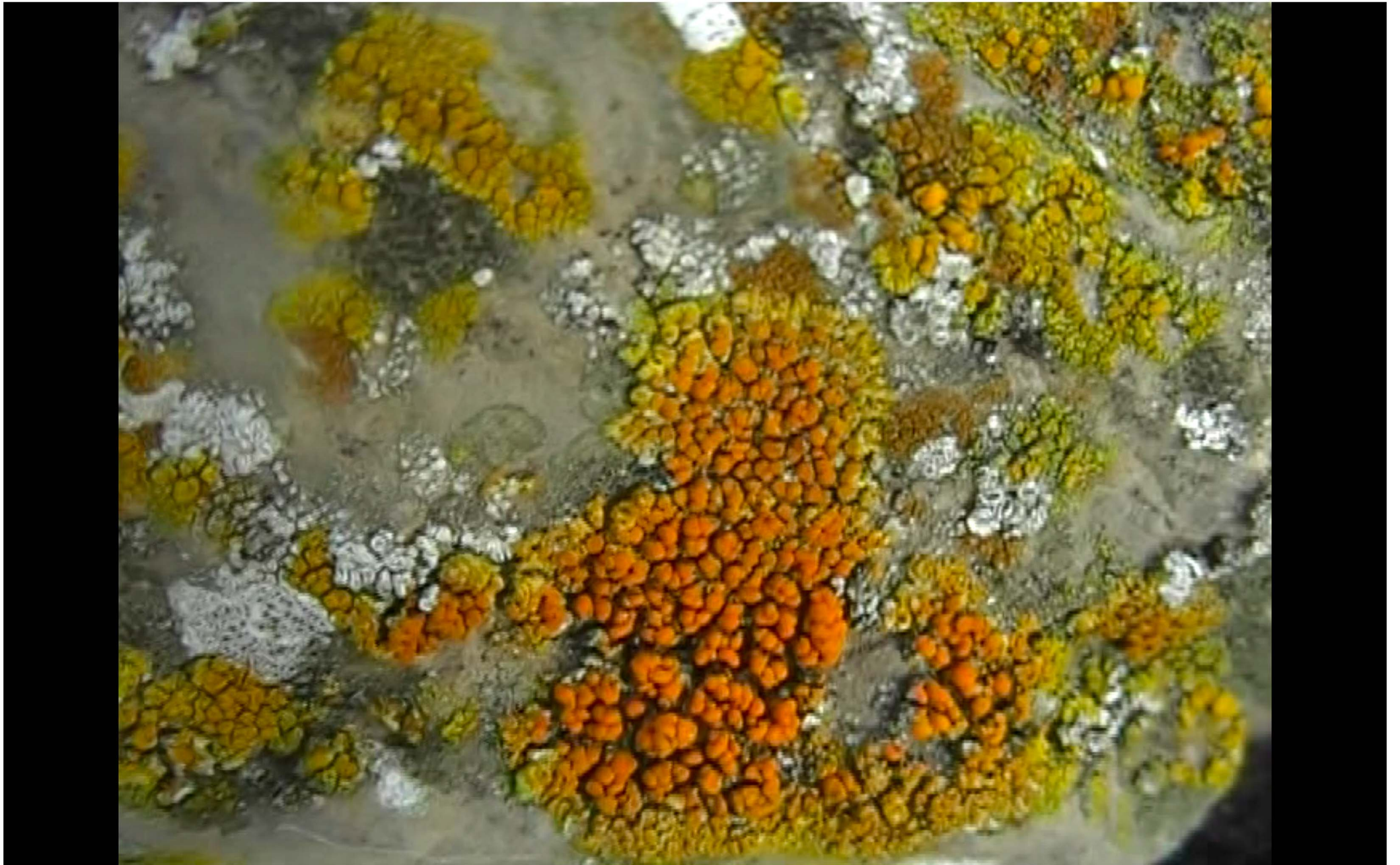
part 48, 2024 videostill