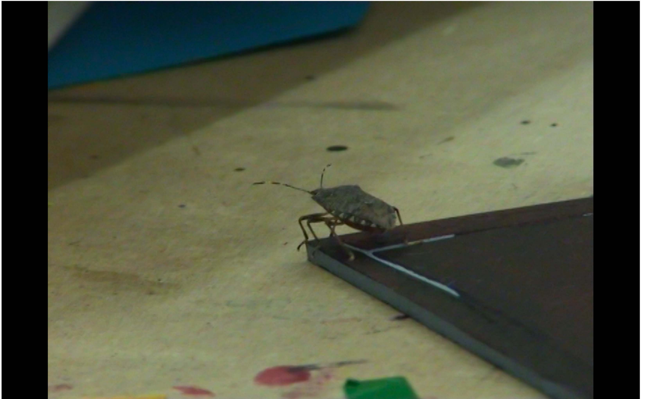
part 48, 2024 videostill