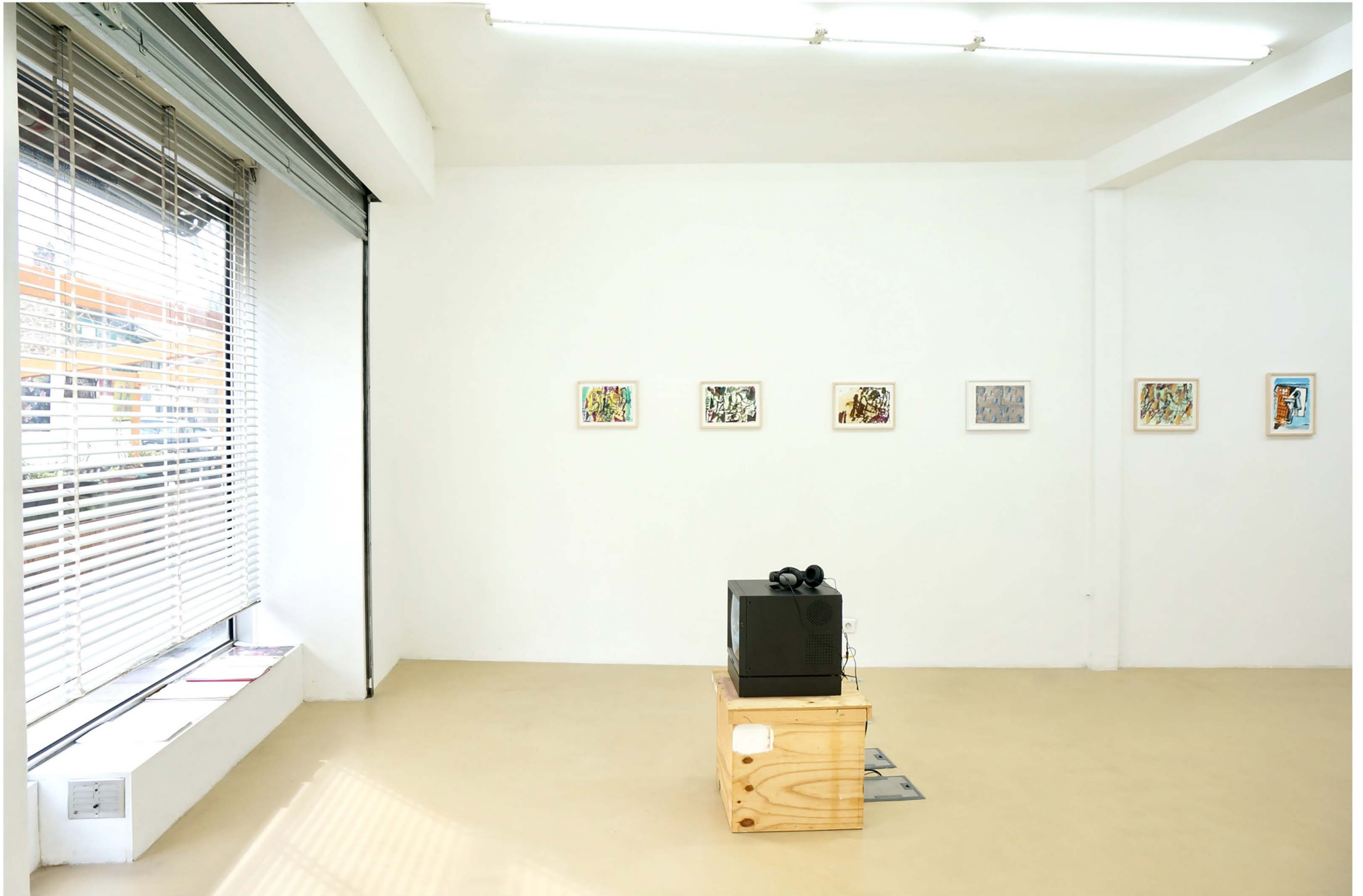
part 48, 2024 installation view Joseph Tang, Paris