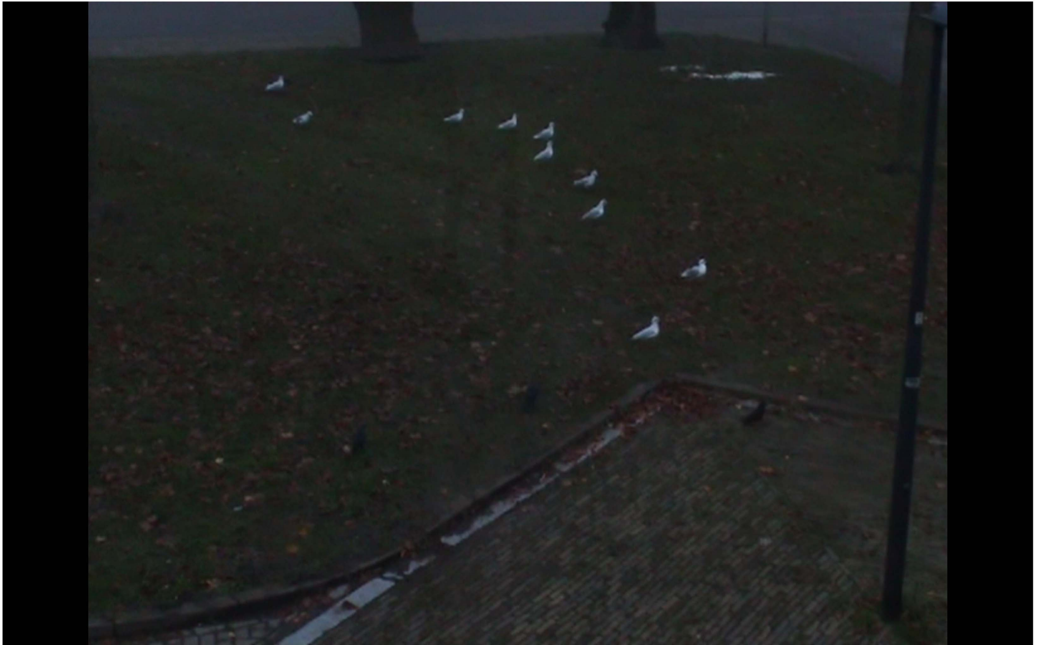
part 48, 2024 videostill