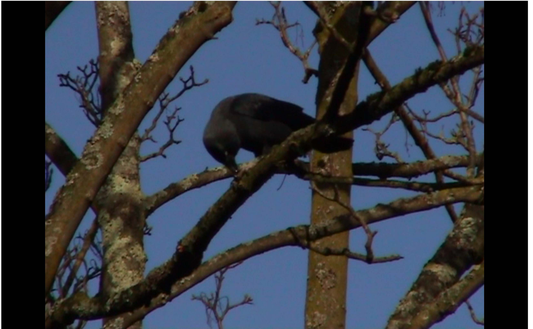
part 48, 2024 videostill